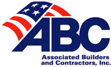
Associated Builders and Contractors