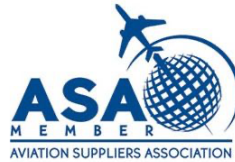
Aviation Suppliers Association