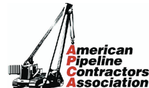
American Pipeline Contractors Association