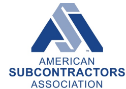
American Subcontractors Association